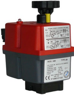
The J3 - 85 quarter turn electric valve actuator

Visual indication of the actuator's operating status is constantly shown by a highly visible LED light.