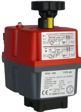
The J3 - 55 quarter turn electric valve actuator

Visual indication of the actuator's operating status is constantly shown by a highly visible LED light.